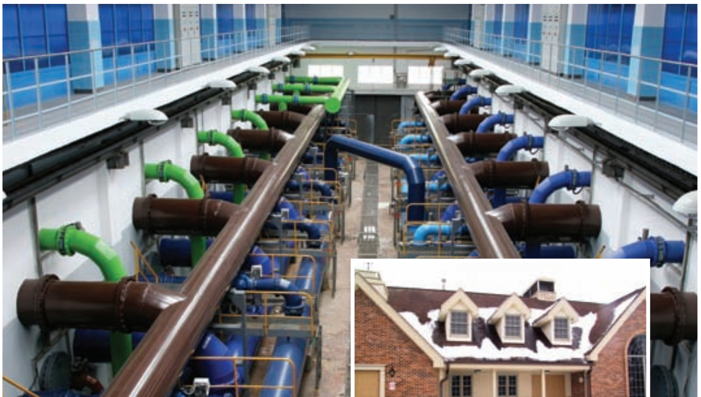
inside a water treatment plant