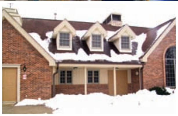
treatment facility in Brookfield, Wisconsin

The chronic condensation problems common to water treatment facilities promote the deterioration of piping, equipment, controls and the physical structure of the facility. Utilities require substantial maintenance budgets to battle the damaging effects of condensation. The cooler conditions present in water treatment facilities increases the relative humidity and diminishes the ability of conventional dehumidification equipment to correct the humidity problem.