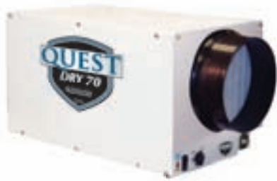
Quest Dry 70